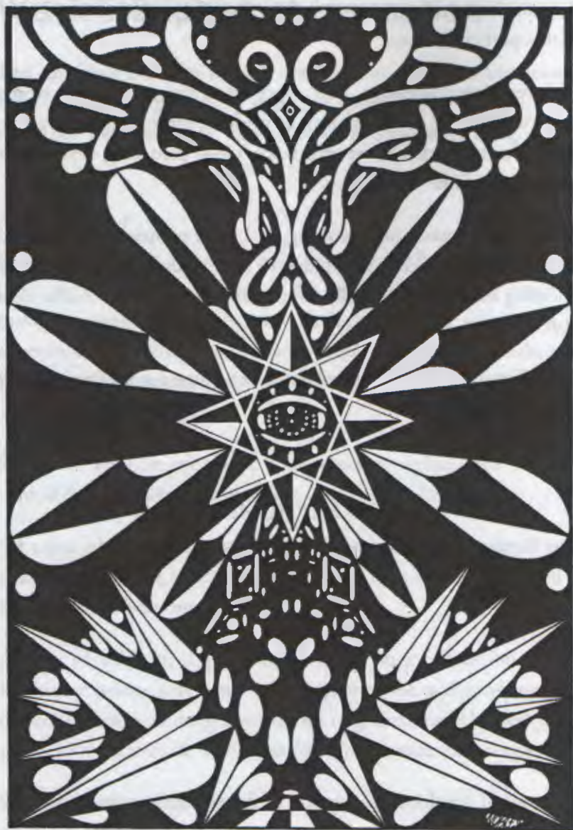
Fig 15 Baphomet by Lee Noble.