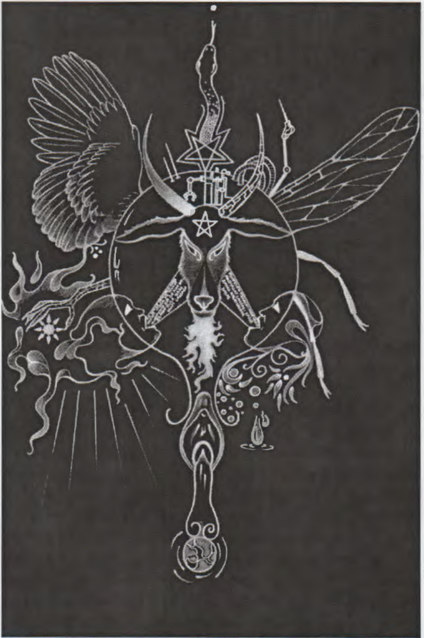
Fig 14 Baphomet by Frater Fux.