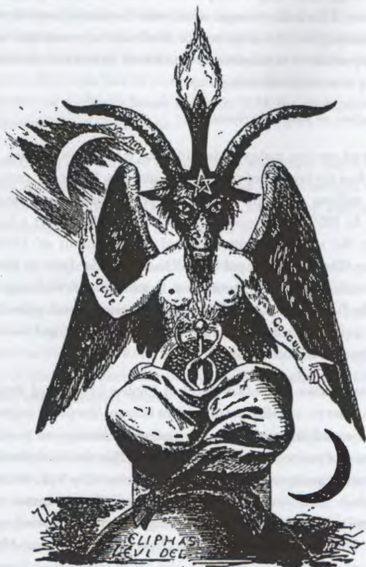
Fig 2 Baphomet, from Eliphas Levi's Dogme et Rituel de la Haute Magie