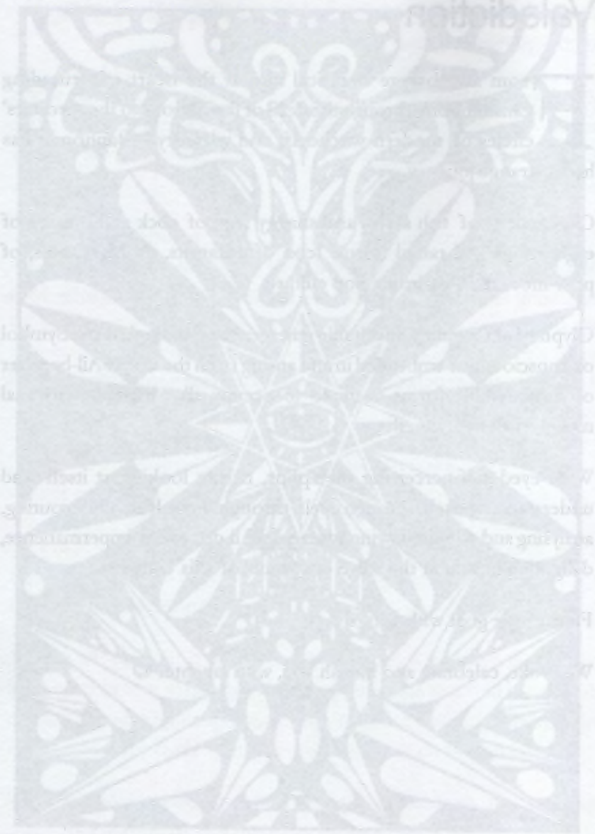
Fig 15 Baphomet by Lee Noble.