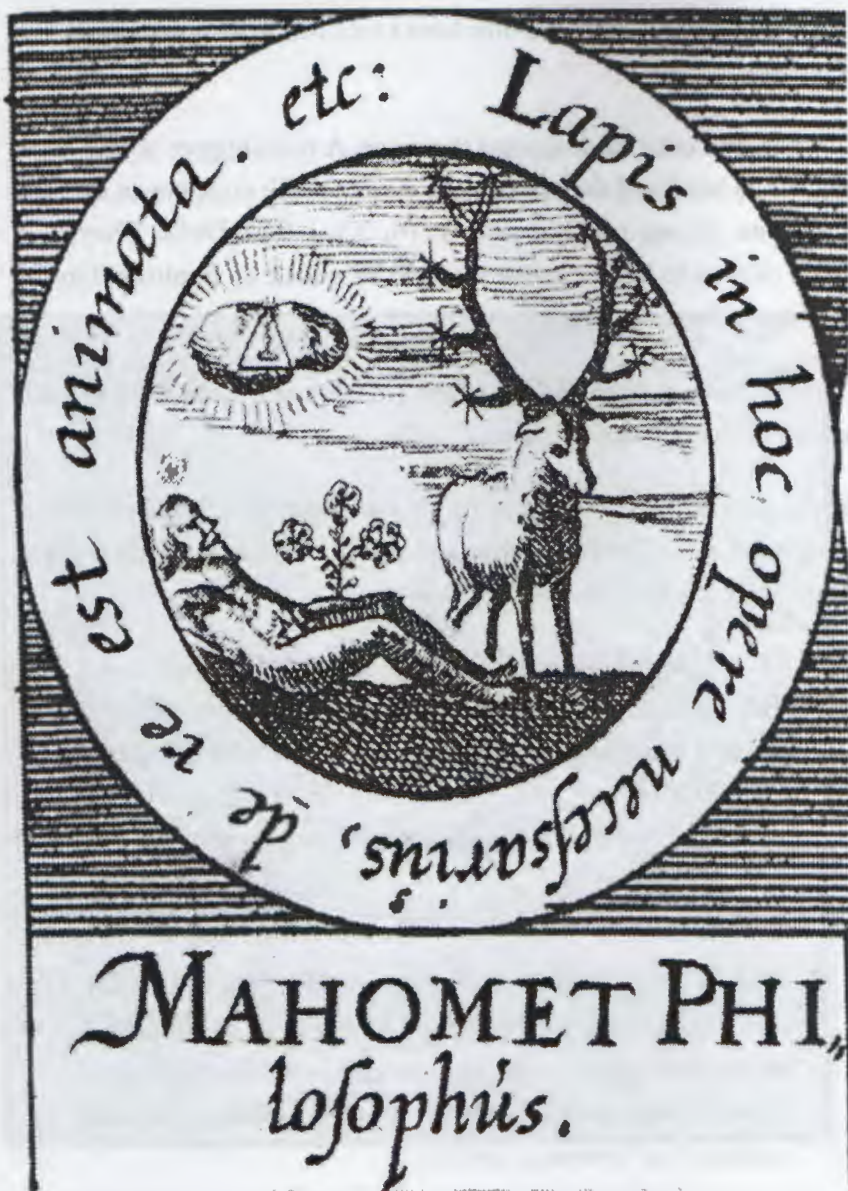
Fig 4 Alchemical Seal reproduced in Stanislas Klossowski de Rola The Golden Game: Alchemical Engravings of the Seventeenth Century .