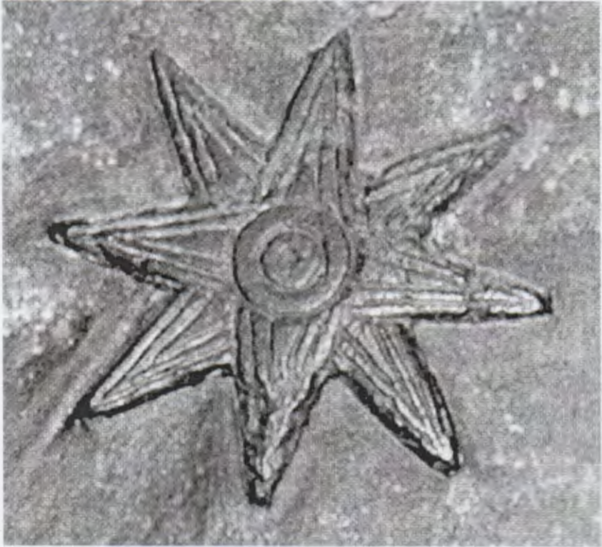
Fig 9 Detail of a stele of King Melishipak I (1186–1172 BC), showing a version of the ancient Mesopotamian eight-pointed star symbol of the goddess Ishtar. Excavated by Jacques de Morgan