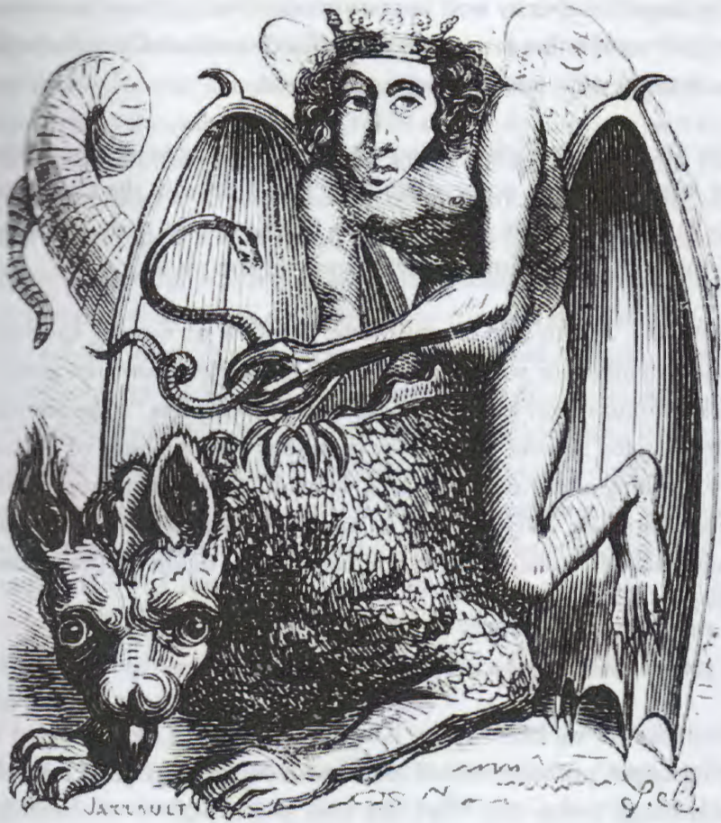
Fig 1 Astaroth, prince of Hell, from J.A.S. Collin de Plancy, Dictionnaire Infernal. Original illustration by Louis Breton, engraved by M. Jarrault.