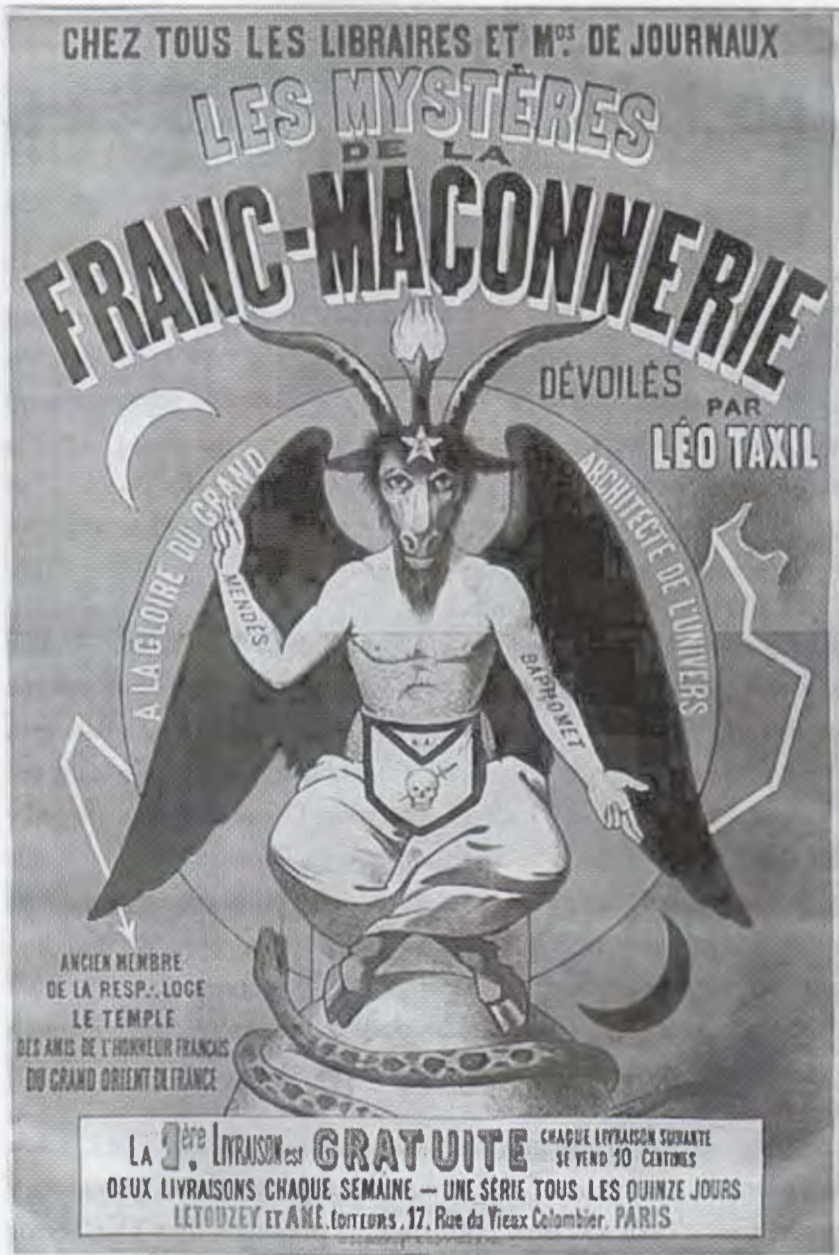
Fig 5 Advertising for Les Mystères de la franc-maçonnerie dévoilés by Léo Taxil