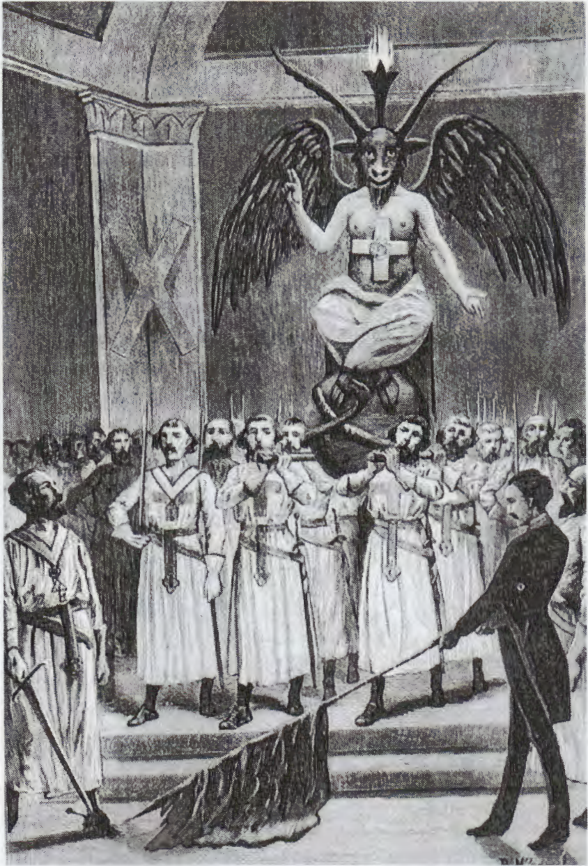
Fig 7 Baphomet at a Freemason session from the work of Léo Taxil.