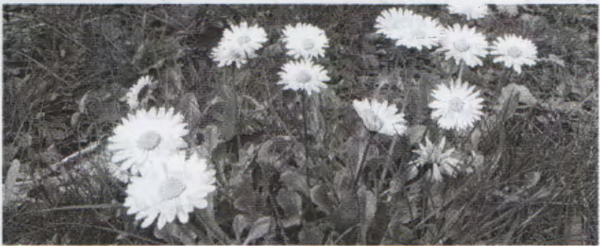
Fig 12 “ Axis of sky and land and sea. In every blade of grass, every day’s eye. ” The Eyes of the Day, photograph by Nikki Wyrđ.