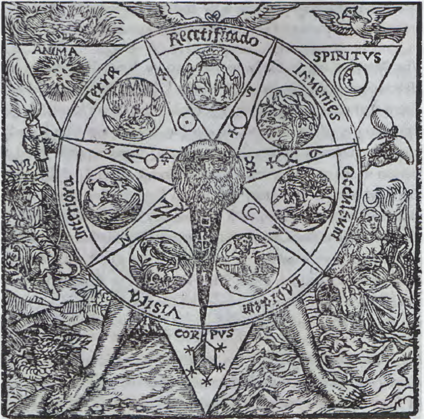
Fig 3 L'Azoth des Philosophes, Basil Valentine, 1659.