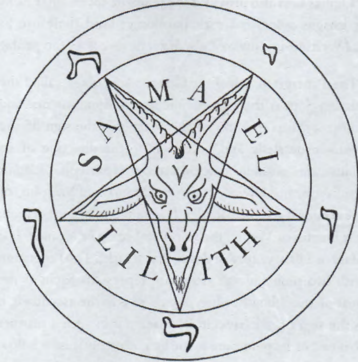
Fig 8 Goat's head pentagram from La Clef de la Magie Noire by Stanislas de Guaita.