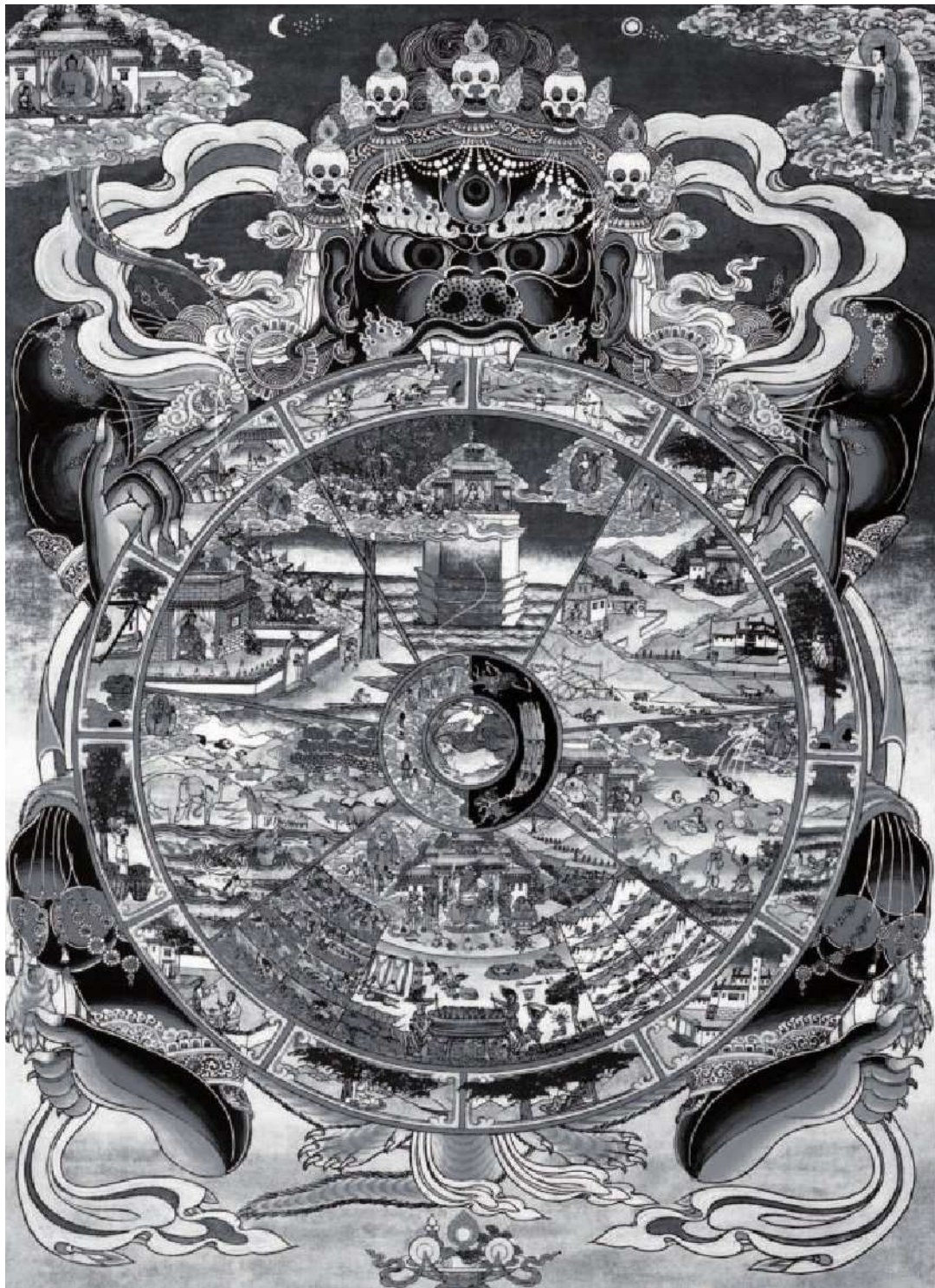
The Wheel of Life (Bhavacakra). The nidanas are situated in the outer rim of the wheel.